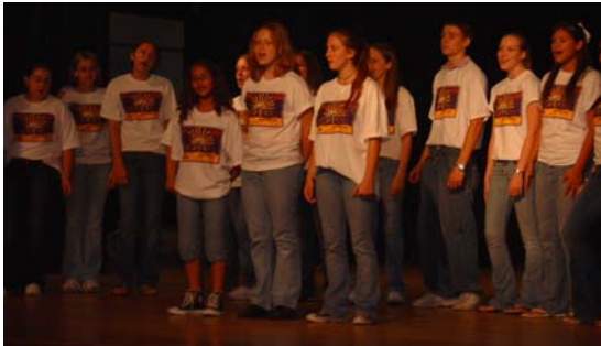
Chorus Camp 2005

Please consider becoming a sponsor this year!